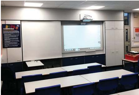
Maths classroom with new teaching wall