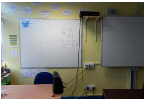
Maths classroom before refurbishment