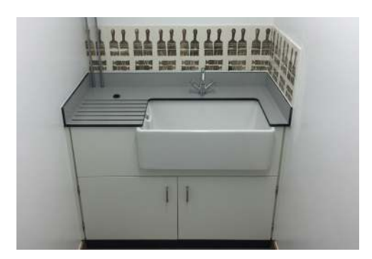
16mm Trespa worktop/upstand & belfast sink