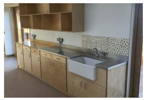
Stainless steel bonded onto MR MDF substrate